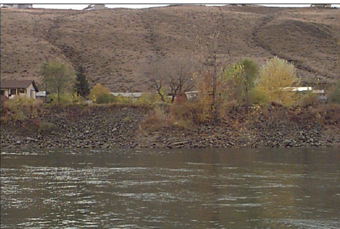
RIGHT BANK VIEW

(NOTE: First point is a DUMMY station offset at 2000 metres from 0 chainage.)