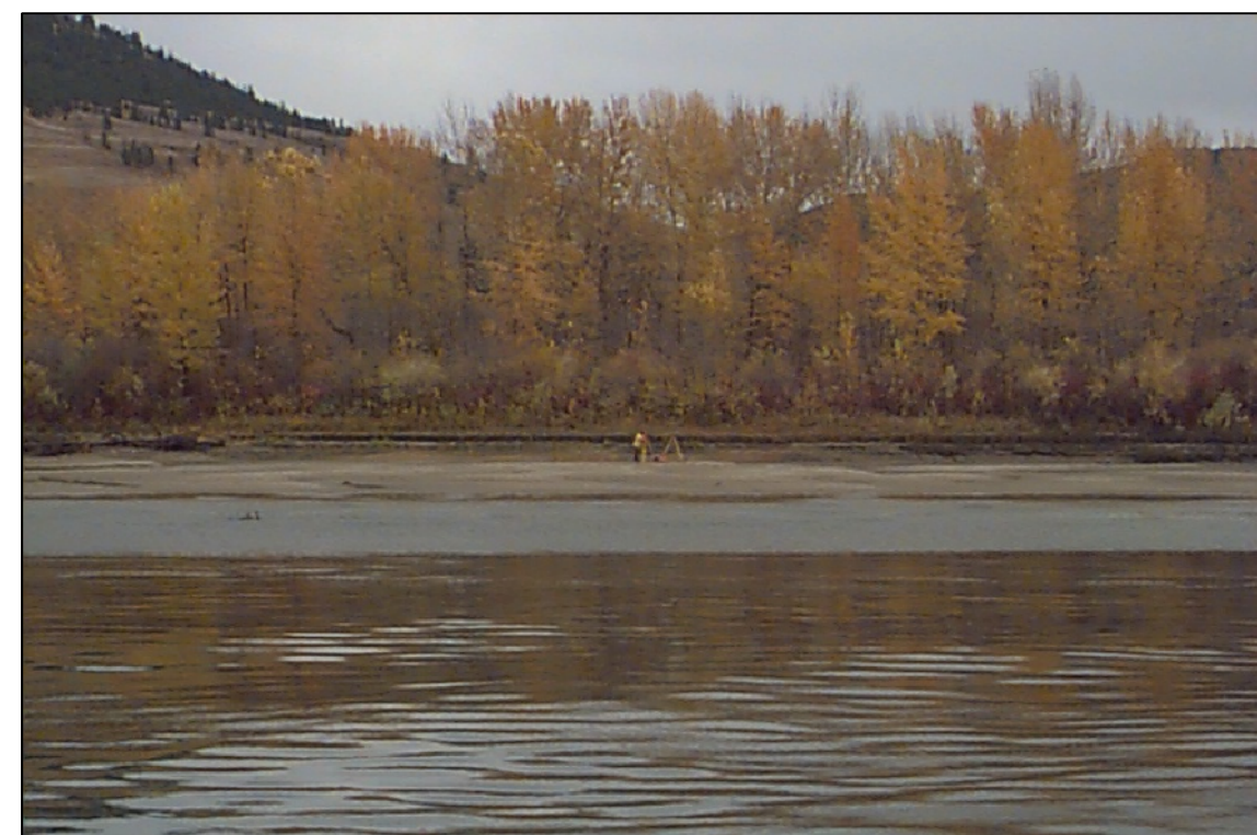
LEFT BANK VIEW